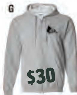
G Full Zip Hoodie Grey/Black 50/50 preshrunk cotton/poly