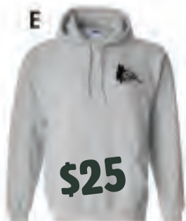
E Hoodie - Grey/Black 50/50 preshrunk cotton/poly