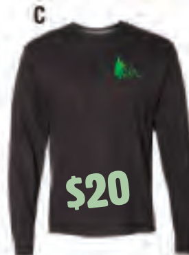
C Long Sleeve Shirt 60/40 cotton/poly