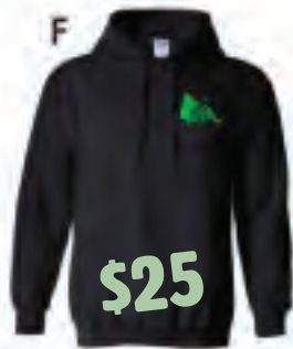
F Hoodie - Black/Green 50/50 preshrunk cotton/poly