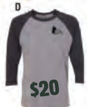
D 3/4 Sleeve Shirt triblend shirt