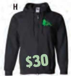
H Full Zip Hoodie Black/Green 50/50 preshrunk cotton/poly