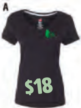
A Short Sleeve LADIES "V" Neck 60/40 cotton/poly

SHOP THE ONLINE STORE HTTPS://OWASIPPE.COM/ WAYS-TO-HELP/STORE/