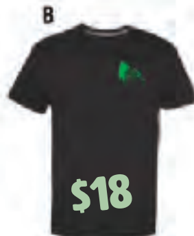
B Short Sleeve Shirt 60/40 cotton/poly