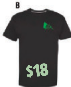
B Short Sleeve Shirt 60/40 cotton/poly