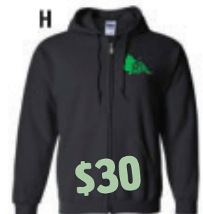
H Full Zip Hoodie Black/Green 50/50 preshrunk cotton/poly