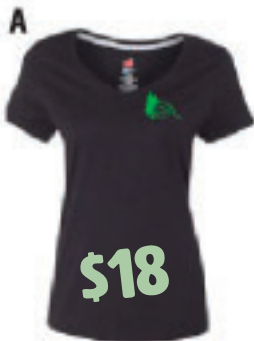
A Short Sleeve LADIES "V" Neck 60/40 cotton/poly

SHOP THE ONLINE STORE HTTPS://OWASIPPE.COM/ WAYS-TO-HELP/STORE/