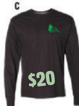
C Long Sleeve Shirt 60/40 cotton/poly