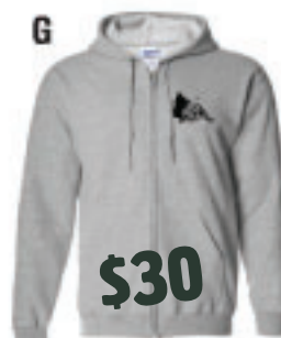
G Full Zip Hoodie Grey/Black 50/50 preshrunk cotton/poly