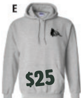
E Hoodie - Grey/Black 50/50 preshrunk cotton/poly