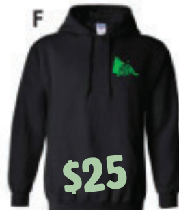
F Hoodie - Black/Green 50/50 preshrunk cotton/poly