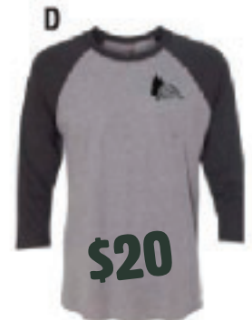
D 3/4 Sleeve Shirt triblend shirt