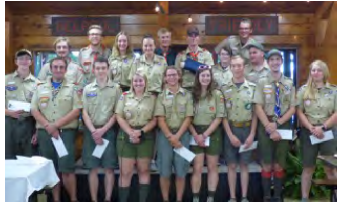
2019 Steve Schaefer Scholarship Fund recipients