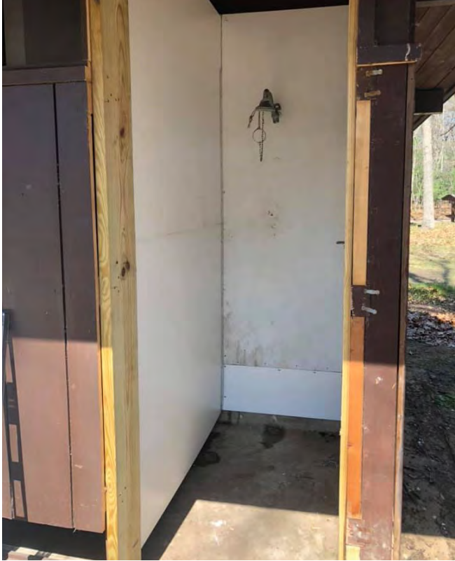
Blackhawk Staff Row Showerhouse