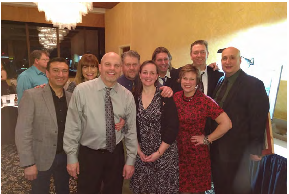
Revelers at last year's 40th Anniversary Dinner Dance and Annual Meeting

will be held in the Ballroom at the Edward Hotel in Rosemont. Same location as the 2018 Dinner Dance, just a different room! Doors open at 6pm and dinner (*heck yes) starts at 7pm. Dancing ends at 11 pm, so take advantage of all the exciting events planned for the evening! The Edward Hotel will have a block of rooms set aside for those traveling from afar (*or aclose). The price is $89 per night plus tax. Use the code, "OSA," for a discount. Rates will apply to the night of the dinner dance and one night before or after. You must book before February 25. It's first come, first serve for the hotel rooms, so don't wait! Please see the flyer (*in this very newsletter) for more details, including the awesome raffle prizes for this years event! ♣